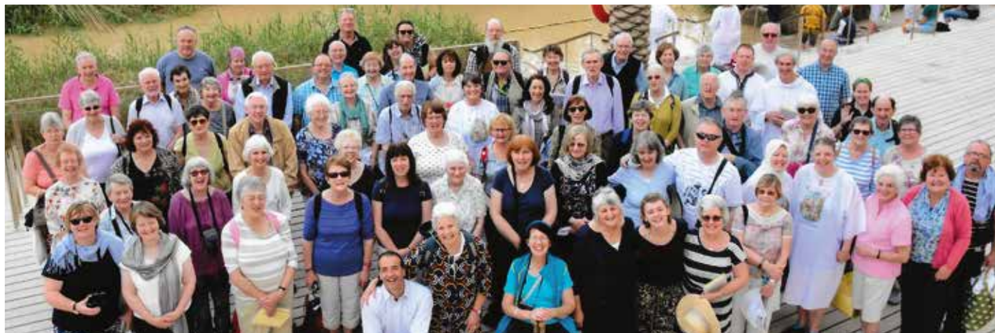
Cumbrian Christians on Pilgrimage in the Holy Land March 2017.

March 7-18 2018 C of E Lichfield/RC Birmingham Dioceses.