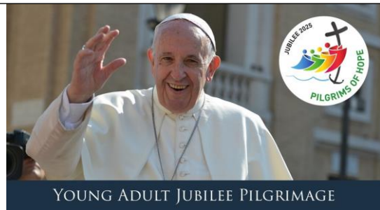
YOUNG ADULT JUBILEE PILGRIMAGE

Family groups, Red shirts (years 10&11), Purple shirts (year 12), Young Helpers, Helpers, Doctors, Nurses, Assisted Pilgrims, independent pilgrims and our Diocesan Clergy are all encouraged to go. Applications will Open January 2025